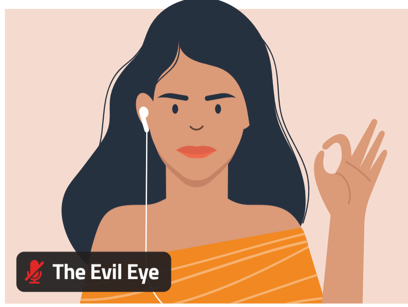
The Evil Eye

Showing the sole's of one's feet or shoes to another person is considered rude: be mindful of how you sit!